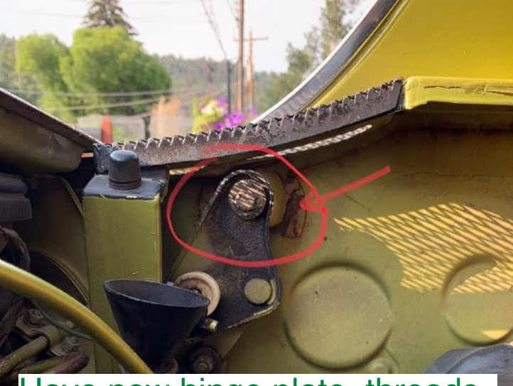
Have new hinge plate, threads and bolt ready to replace damaged left rear trunk hinge all others OK.