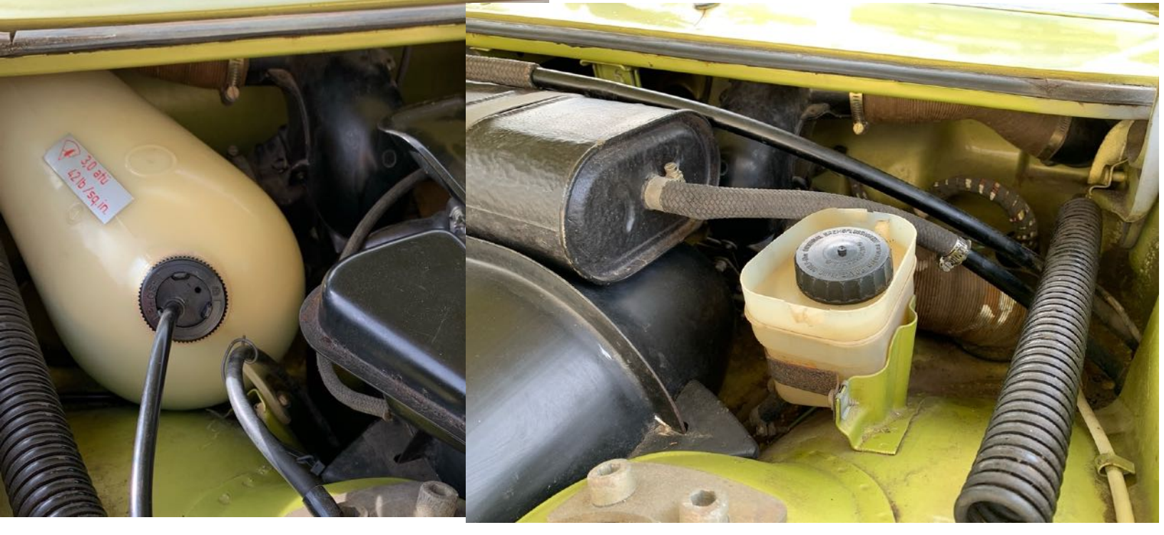
No rust at front firewall in the front trunk - the washer/spare tire still works!!