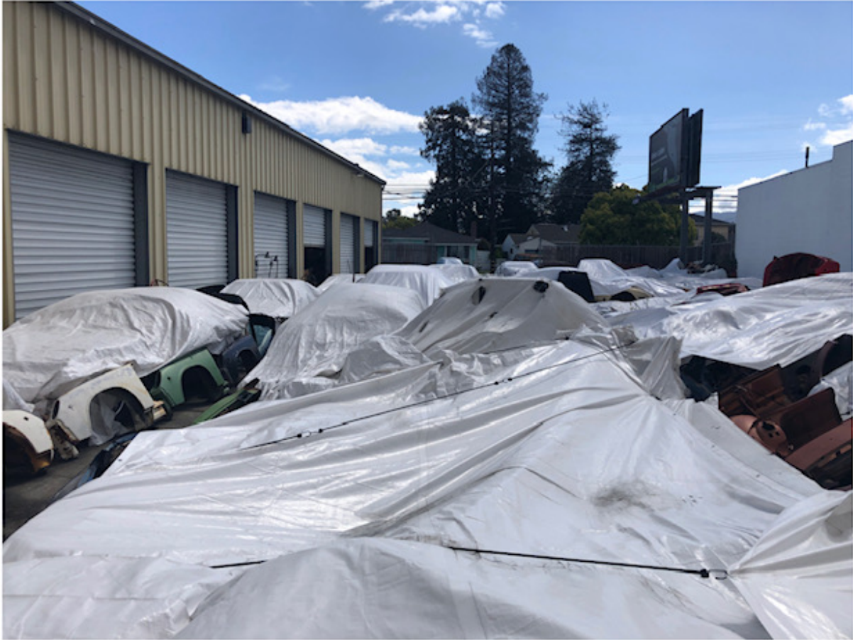
7000sft Lot – Yes those are Porsches under there...