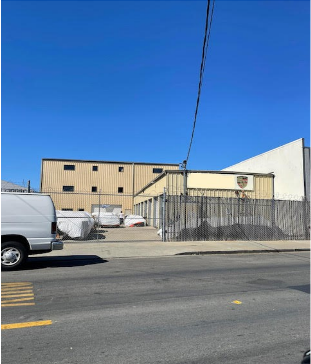
Placerville – Menlo Park, CA (530) 409-1647 www.premier-propertygroup.com