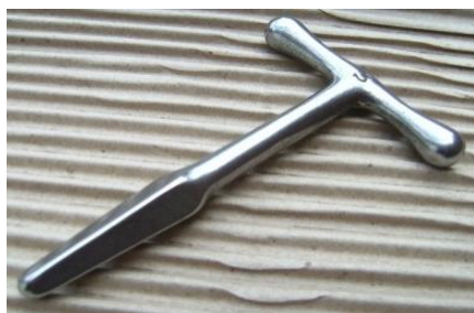
Type 2 engine lid and fuel flap church key Splitscreen