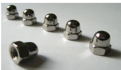
Dome head sump nut x 6 M6, Chrome plated Item price per set of 6