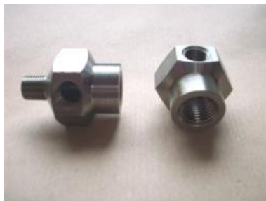
Oil pressure / temperature sender adapter Type 1 / Type 4, Steel, Zinc plated