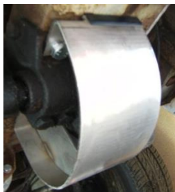
Type 2 splitscreen steering box guard kit Stainless steel, RHD or LHD