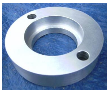
Type 2 dual circuit master cylinder adapter Splitscreen dual circuit brake conversion, Aluminium