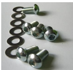
Tinware screws and washers x 25 M6, Button allen head, Stainless steel Item price per set of 25