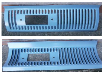
Type 2 dash radio repair panel section Splitscreen, RHD or LHD